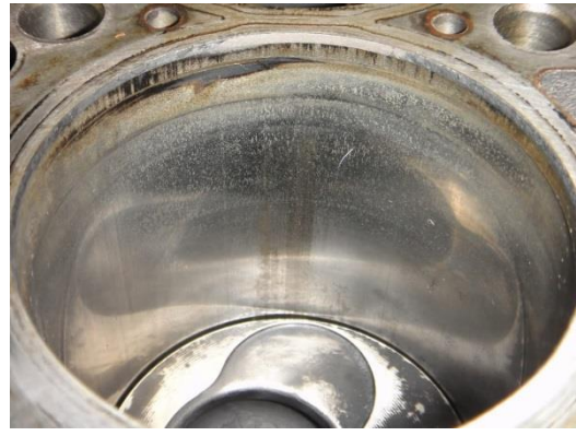
Fig 3 Extensive cylinder polishing and glazing

Poor combustion causes the injectors to become clogged with soot, causing further deterioration in combustion and black smoking. The problem gets even worse with the formation of acids in the engine oil caused by condensed water and combustion by-products which would normally boil off at higher temperatures. This acidic build-up in the lubricating oil ultimately causes damaging wear to bearing surfaces .